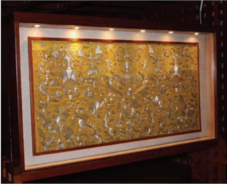
Figure 8. Sicilian manufacture, frontal, first half of 18th century, taffetas embroidered with silver thread, Monreale, former Benedictine dormitory, already at the Church of the Trinità al Collegio di Maria.