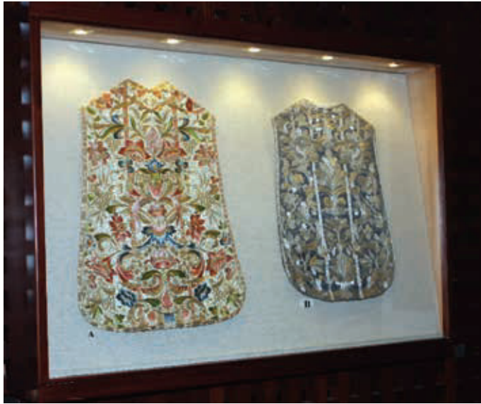
Figure 6. (A) Sicilian manufacture, chasuble ( pianeta ), first half of 18th century, satin embroidered with polychrome silk threads, Monreale, former Benedictine dormitory, already at the Diocesan Museum deposit. (B) Sicilian manufacture, chasuble ( pianeta ), first half of 18th century, gros de tours (ribbed silk fabric) embroidered with silver thread, Monreale, former Benedictine dormitory, already at the Diocesan Museum deposit.

Four altar-frontals complete the exhibition of textile artifacts, once used to enrich the altars in particular solemnities. Two of them come from the church of the Trinity in Monreale, annexed to the College of Mary, an ecclesiastical building with a particular octagonal plan. Their original provenance suggests a monastic manufacture, as was often the prerogative for these valuable artifacts. Both artefacts are enriched by sumptuous embroidery which, following a symmetrical and specular arrangement in a horizontal direction, occupies the entire surface of the underlying fabric. However, in the altar-frontal embroidered in a pictorial manner (Figure 7) a division of the space into two sections is visible: an upper one, to simulate the rich fold of a hypothetical altar tablecloth with scalloped perimeter; and a lower one, occupied by various floral typologies whose stylization is clearly inspired by the bizarre decorative motifs that adorned the fabrics of the first twenty years of the eighteenth century.