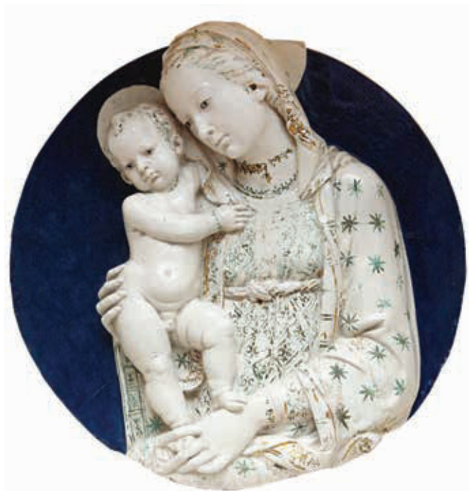
Figure 2. Andrea della Robbia, Madonna col Bambino , late 15th century, glazed ceramics, Monreale Diocesan Museum.

In a later record dated 1 July 1934, the artefact was attributed to the school of Andrea della Robbia, an attribution which is still valid today, after being attributed at one point to his brother Luca; the final attribution was made because the statue was “ caratterizzato da motivi descrittivi e sentimentali legati alla gestualità affettuosa della Madonna e del Bambino raffigurato sempre alla sua destra, oltre che per la vivacità espressiva del Bambino e la raffinata bellezza della Madonna che si distinguono dall’austerità e severità dell’opera di Luca Robbia [...] e per l’uso della doratura a freddo maggiormente utilizzata da Andrea ” [3] (transl. characterized by descriptive and sentimental motifs related to the affectionate gestures of the Madonna and the Child who is always depicted on her right, as well as by his expressive vivacity and the refined beauty of the Madonna which distinguish themselves from the austerity and severity used by Luca Robbia in his work [...] and the cold-gilding used mostly by Andrea).