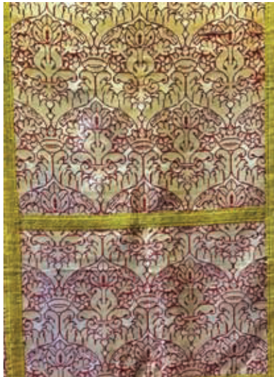
Figure 5. Spanish manufacture, tunic (tonacella), second half of 16th century, overshot lampas textile with two wefts, Monreale, former Benedictine dormitory, Duomo.

The other tunic (Figure 5), with a white background must also be attributed to Iberian manufacture.