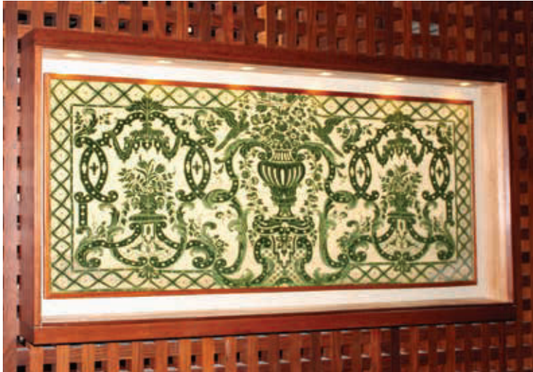
Figure 9. Roman manufacture, frontal, 1765-1767, voided velvet with one pile warp, ciselé, in overshot weave, Monreale, former Benedictine dormitory, Duomo.