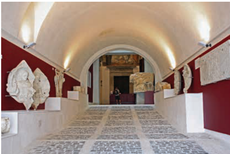
Figure 1. Marble fragments from the Abbey of Santa Maria del Bosco in Calatamauro, 16th and 18th centuries, Monreale Diocesan Museum.

Among the artworks of Santa Maria del Bosco exhibited at the Diocesan Museum are some fragments of marble sculptures situated at the entrance (Figure 1) and a glazed terracotta tondo depicting the Madonna con il Bambino (Figure 2), better known as the Madonna del Bosco, exhibited in the hall dedicated to Renaissance artworks, where it is the main focal point 8 .