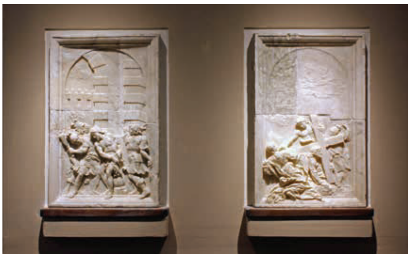
Figure 3. Unknown Sicilian sculptor, Flagellazione and the Caduta di Cristo sotto la Croce , third quarter of 18th century, carved marble, Monreale Diocesan Museum.