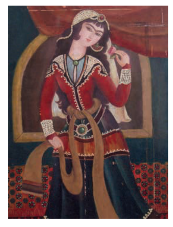
Figure 2. The sample painting depicting a Qajar princess (unknown artist).