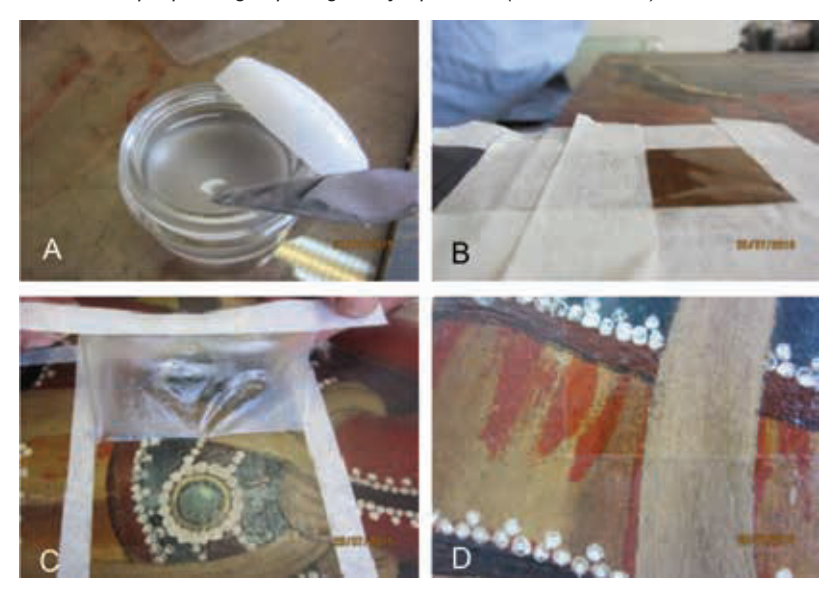
Figure 3. A) Using the gel prepared by the researcher for cleaning; B) first test of the gel for cleaning painting; C) removing the gel from the surface of the painting after testing on a sample; D) segments of the painting cleaned with the gel are clearly distinguishable from other segments.