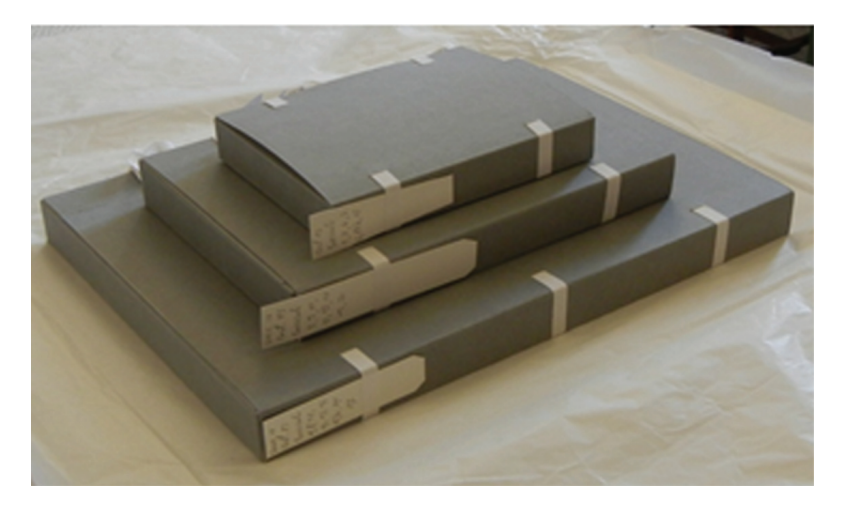
Figure 5. Protective boxes for correct storage of archival documents.