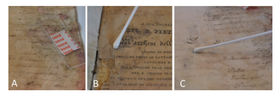
Figure 2. Non-invasive sampling on documents. (A) Using nylon membrane and (B-C) sterile swabs, in ALP and IMP samples, corresponding to pigmented areas and fragile portions of the paper.

For each document, two samplings using nylon membranes and one sampling using sterile swabs were performed in those areas mainly affected by pigmentation, discoloration, foxing phenomena and loss of material.