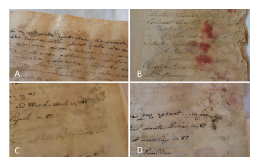
Figure 1. Paper alterations. (A) AMP sample, dark spots and damp patches; (B) ALE sample, reddish spots, and loss of material; (C-D) ALP sample, violet and greenish stains, and loss of material.

Sampling of microbial (fungal and bacterial) structures from damaged archival documents was carried out using non-invasive methods, and in particular by: i ) sterile nylon membrane fragments (10 cm2) ( Hybond, Amersham H+) gently pressed (for 30 seconds) over the investigated area (Figure 2 A); ii ) sterile swabs by wiping across spots showing visible damage and staining (Figure 2 B,C), and then used in culturing techniques to obtain in vitro growth of the microorganisms.