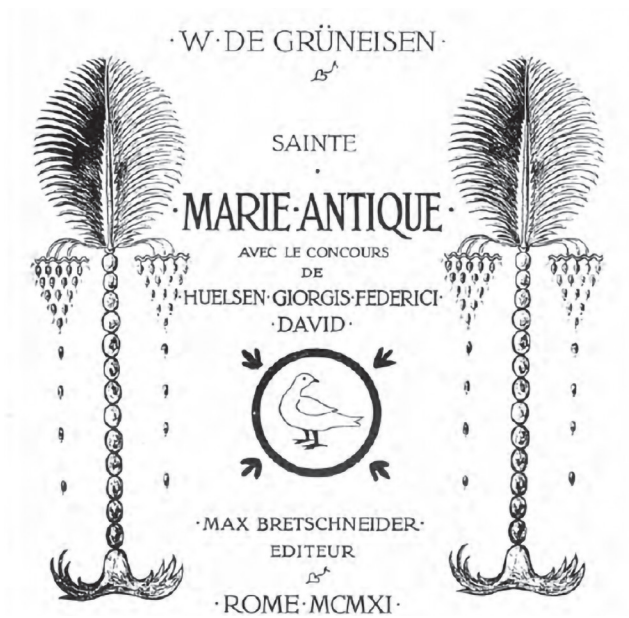
Figure 2. Title page of a luxury edition published by Max Bretschneider (1911).