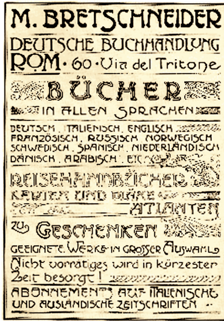
Figure 1. The poster for Max Bretschneider's bookshop in Via del Tritone, Rome (1919).