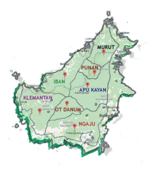
Figure 1. Tribal distribution map

The Dayak tribe of Borneo island is divided into 7 groups called "STAMMENRAS" with a total of 405 sub-tribes [14], the division is formed based on clumps, the area of habitation and its origin and they are scattered in various regions in Borneo. Although it is one ethnic group (Dayak), each indigenous sub-tribe has cultural characteristics and local traditions that vary according to the region or nature where they live [15]. The names of the clumps and tribes are shown in Table 1, with the map in Figure 1 indicating the position occupied by the different tribes.