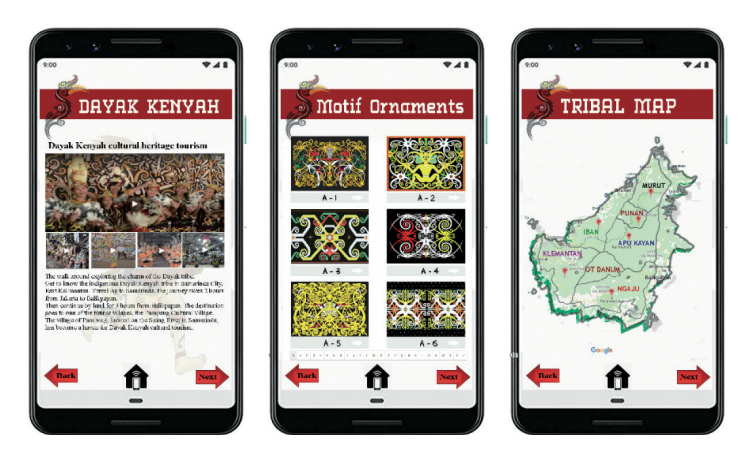
Figure 5. Screenshot of the mobile cultural heritage app of the Dayak tribe in Borneo.

The Dayak people in Borneo, with their diversity of culture and local knowledge from various tribes, are now experiencing challenges in preserving their existence. Lack of community interest, especially for the younger generation in understanding and knowing the tribes in Borneo's tropical forest areas, is one obstacle in its development. This is due to the difficulty of obtaining information about the diversity of Dayak tribes on the island of Borneo and having limited access or media in exploring information on cultural heritage. In addition, the use of information technology for things other than cultural diversity contents is more advanced, so that information about the cultural diversity of the Dayak tribe will steadily disappear.