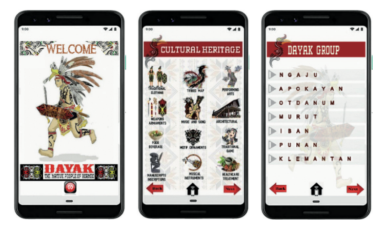
Figure 4. Screenshot of 3 main sections in the mobile cultural heritage app for the Dayak tribe, Borneo.

The mobile cultural heritage application for Dayak tribe digital literacy provides information about the cultural diversity of each Dayak ethnic group. The built application consists of three main sections, i.e. the cultural heritage menu, the Dayak groups and the tribal maps shown in Figure 4.